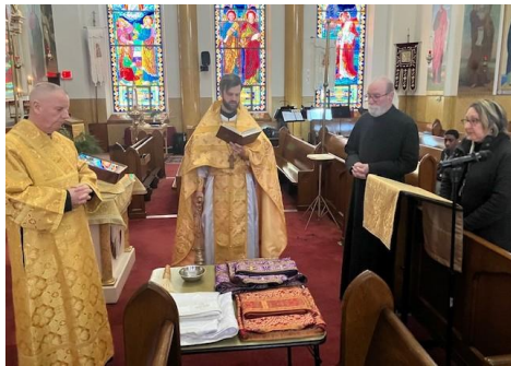
Blessing of new Vestments