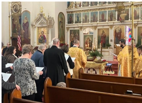
Swearing-in of Parish Council Members