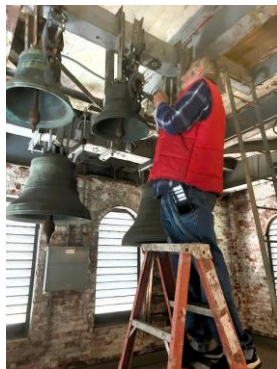
Pictured here is VP Jerry Kopko repairing the Pearl Street gate and lubricating the bells of the church.