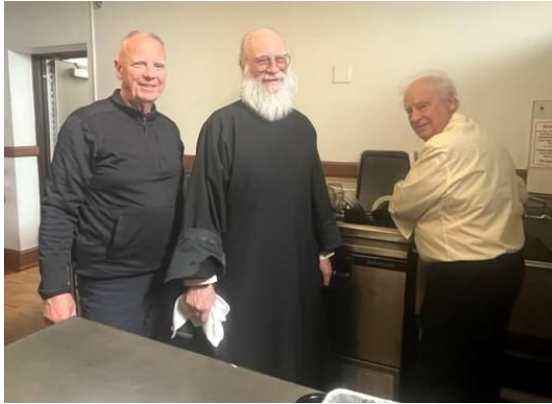
The Curran brothers as the clean-up crew at coffee fellowship: