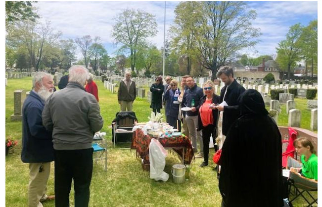
Blessing of the graves began at Lakeview Cemetery on Sunday